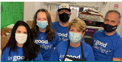
Thanksgiving Meal Outreach

The holidays may have looked different this year due to COVID-19, but it didn't stop homeless and hurting men, women, and children from receiving food, hope, and healing. Check out our holiday outreach recap below to see the impact of this season. Thank you so much for your support! None of this would be possible without the time, talents, and treasures that you give to Light of Life.