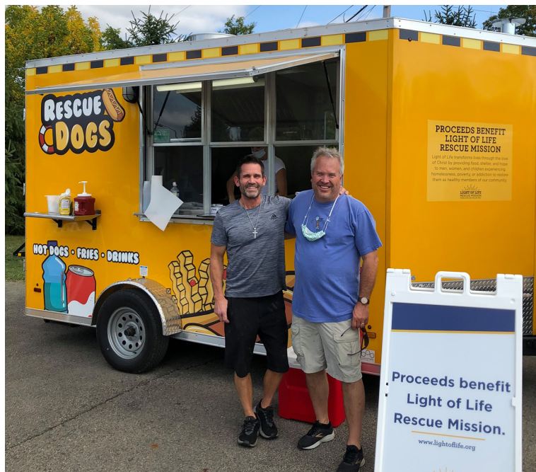
The new Rescue Dogs food truck, benefiting Light of Life!

A New Venture— In Fall 2020, with the help of friends of the Mission, we launched Rescue Dogs, a food truck benefiting Light of Life. The food truck helps raise awareness and funds for the Mission. Serving up locally sourced beef hot dogs and French fries, Rescue Dogs is available for private events, church functions, and community gatherings. For more information about Rescue Dogs, or to book the truck for an upcoming event, please call 412-258-6182. You can also visit the Facebook page @rescuedogsfoodtruck for the upcoming schedule.