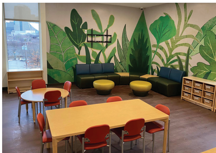
The new Children's Playroom at Voegtly Street.

The new building brings dignified space to serve more than ever before in a brand-new Day Center and Women and Children's Shelter. Sherry says that these are the two most exciting aspects in her opinion!