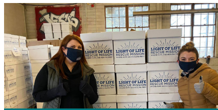
Thanksgiving Dinner Box Outreach

In addition, volunteer teams delivered hot meals to 9 local senior high-rises in the area. Though this year we couldn't fellowship with the individuals there, we were grateful that they had a hearty meal and knew that they are cared for.