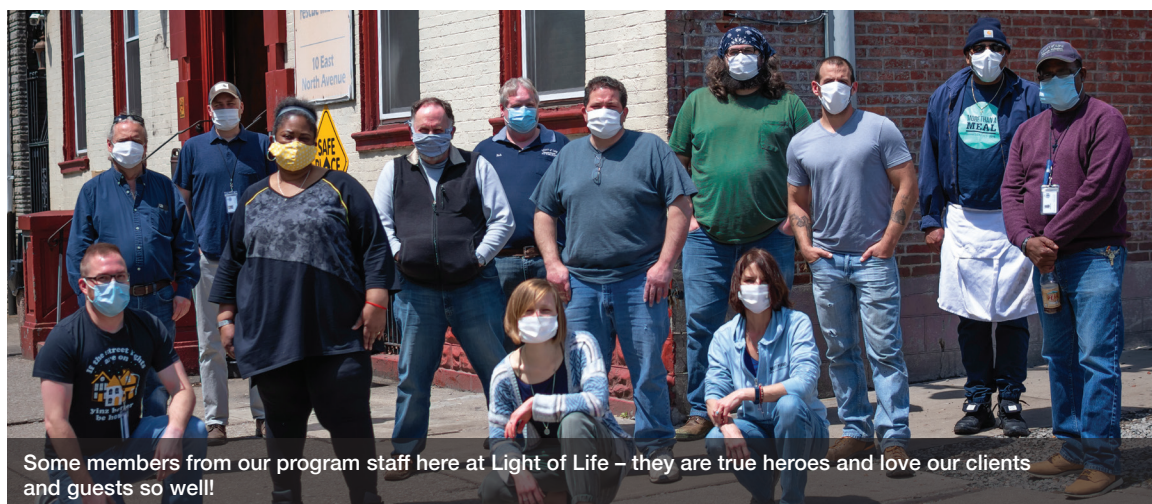
Some members from our program staff here at Light of Life – they are true heroes and love our clients and guests so well!