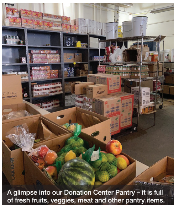
A glimpse into our Donation Center Pantry – it is full of fresh fruits, veggies, meat and other pantry items.

Our Street Outreach team makes daily rounds to the homeless camps in the area and provides them with soap, hygiene products, disinfectant wipes, water, and any additional resources that they may need.