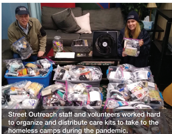
Street Outreach staff and volunteers worked hard to organize and distribute care kits to take to the homeless camps during the pandemic.