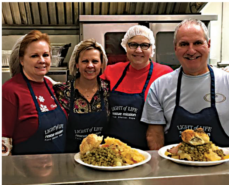
Christmas Dinner Volunteers

Please remember Light of Life Rescue Mission as you consider making end-of-the-year donations to your favorite non-profits! All donations received by December 31st will be acknowledged by January 2018 with a tax-deductible receipt. Thank you for helping us provide food, shelter and hope to men, women and children in need.