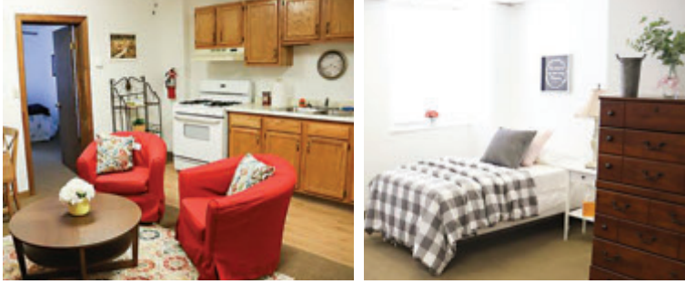
Two of the newly decorated apartments

Light of Life owns an apartment building on the North Side that we recently renovated to meet a need we have seen for single women WITHOUT children or without custody of children for at least 9 months. Named the Sisters' Recovery House, this living space provides a community and independent living space for women who may otherwise be homeless. While living in these apartments, the women join the same programming the women in our family program attend. This is a new Women's Program that is in addition to what we already provide.