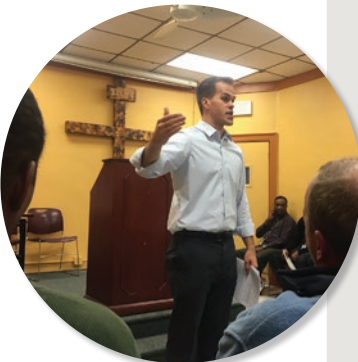
Chapel Services are held every day of the year.