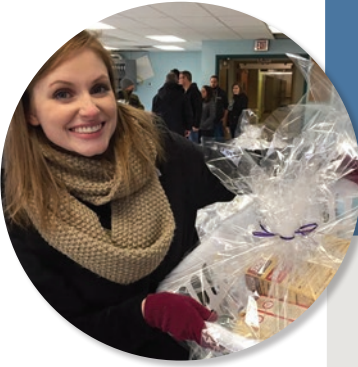
Thanksgiving baskets – distributed to families with a need.

The Thanksgiving and Christmas holidays are big for Light of Life. And because of you, we were able to bless so many during a time where family and giving are emphasized. Here's a recap of all you helped provide for men, women and children: