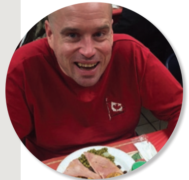
One of our Christmas meal guests has a message for you: "I appreciate the time volunteers took to serve the meal. Their caring about us is a sign of love."

meals for our Christmas Banquet on December 22nd at the Mission and delivered to local high-rises. We are grateful for the generosity of Hefren-Tillotson, the title sponsor of our banquet.