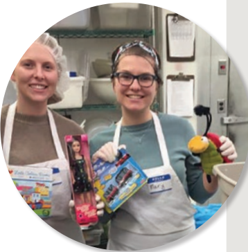
Volunteers help with Christmas Giving Project gifts for the men, women and children.